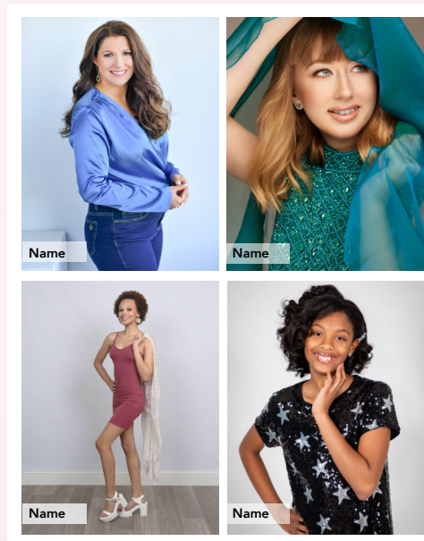
New Modeling Magazine Page Layout