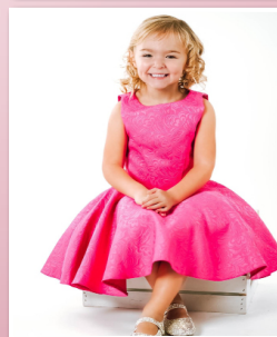
New Modeling Magazine Page Layout